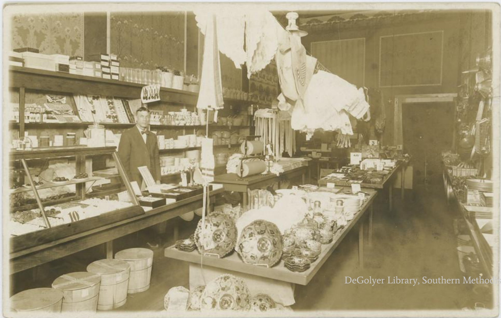
DeGolyer Library, Southern Methodist University