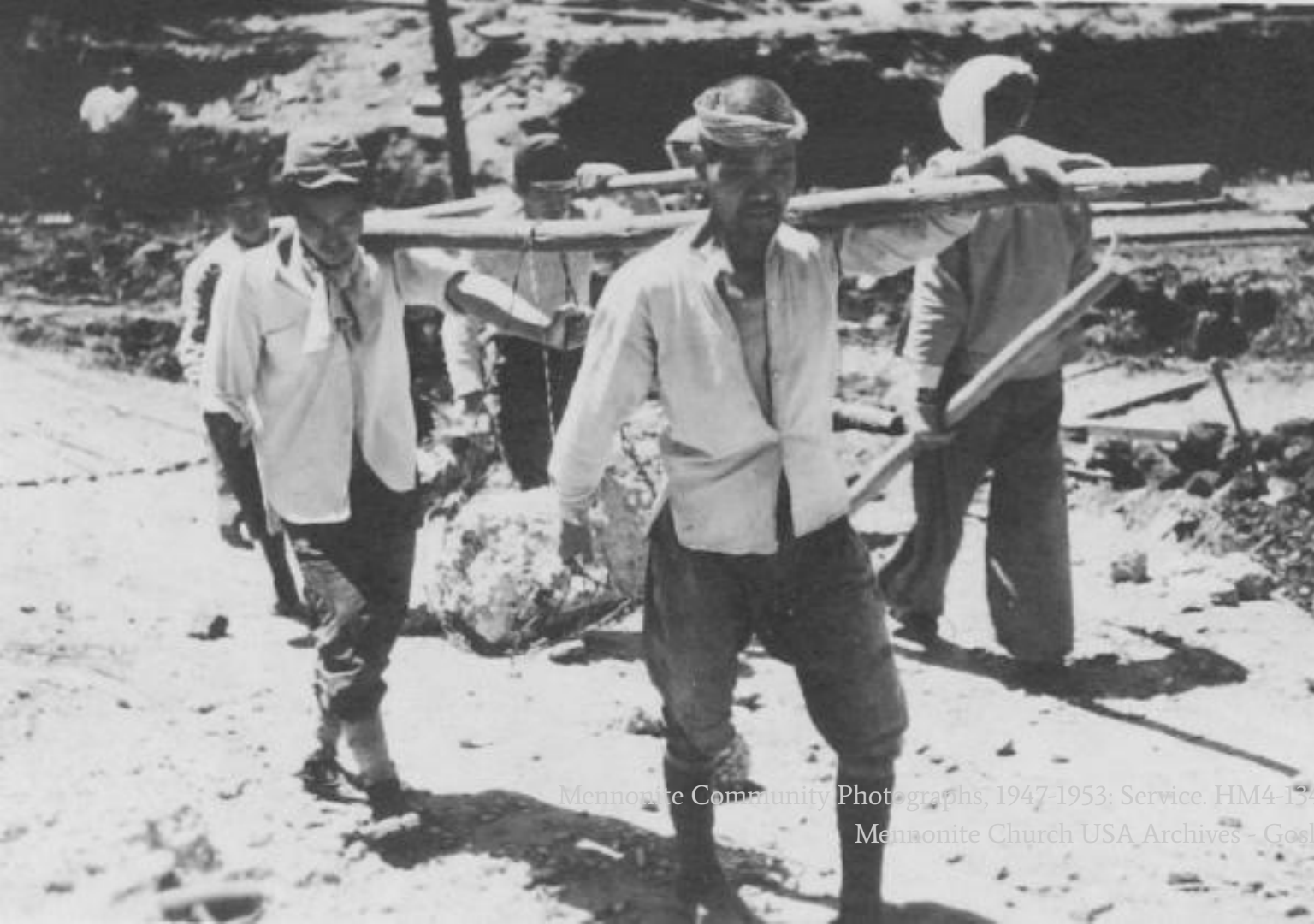
Mennonite Community Photographs, 1947-1953: Service. HM4-134 Box 1 Photo 030-43.